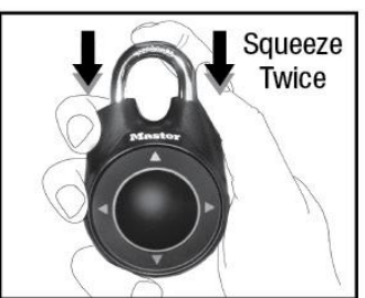
3. IMPORTANT: INSERT THE SHACKLE INTO THE LOCK AND SQUEEZE FIRMLY TWICE TO "CLEAR" IT